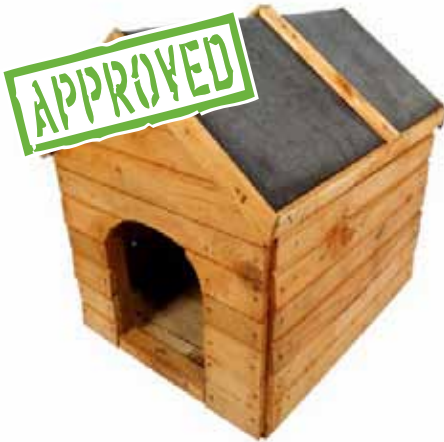
Figure A Dog House Examples